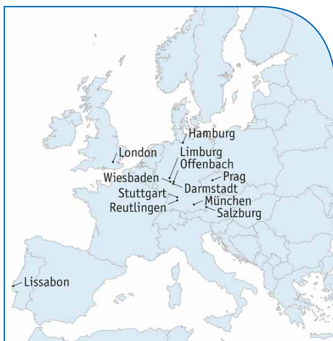
Litigation on Clean Air in Europe; Design: DUH

The subprojects of the »Clean Air« -partners can be divided into several different project areas: capacity building, car traffic, public transport, bicycle policy, shipping and the advice and support of decision-makers. In the following it is described, which actions have been taken by which partner and which successes have been achieved.